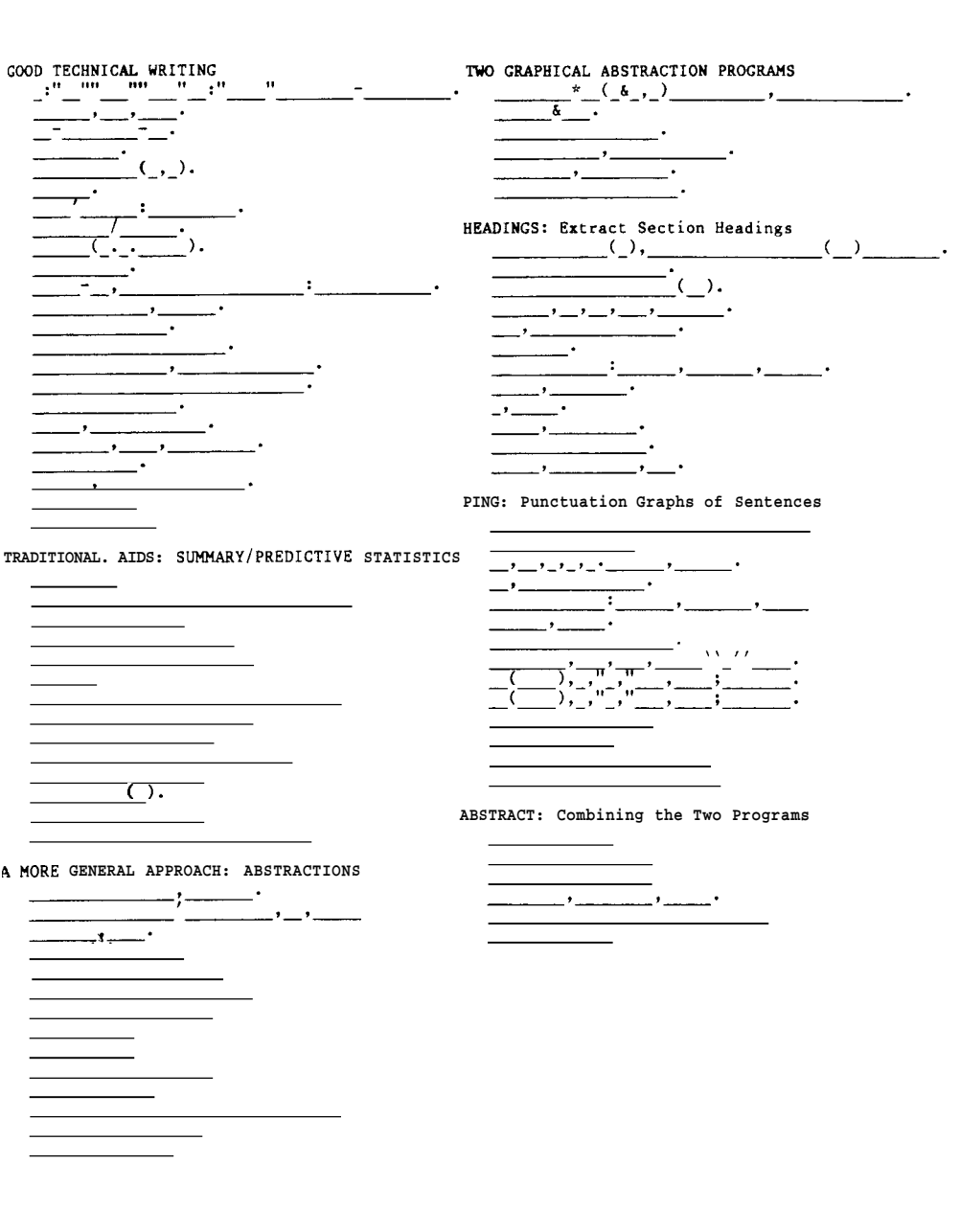
Figure 2. Abstraction of this document. The combined interleaved outputs of the HEADINGS and PUNC programs for a draft of this document. Note how combining the two programs allows the writer to estimate section length.

385 Perlman & Erickson / Graphical Abstractions