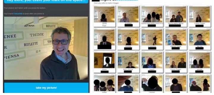
Fig 1. The #selfiestation application

Early in 2014 we built the #selfiestation, a kiosk for users to take photos of themselves, and deployed it in an IBM office. As the kiosk displays photos taken over time in the physical space, which has a predefined "network" of residents and visitors, its setup is comparable to social media sites in many ways. IBM also has a history of adopting social media tools, such as blogs (2002), social bookmarking (2004), and social networking (2007)[3] and we were motivated to understand how employees would engage with this new form of social media. What began as an exploration into keeping a visual history of visitors and residents, evolved into a long-term observational study of the creation and use of selfies and a first account on the use of selfies in the workplace. This study draws on usage data (821 photos of 336 users over 24 weeks) and 10 user interviews. Our analysis addresses the overall adoption in the workplace, motivations for its use and implications for the work environment, as well as patterns evolving in its use. This joins a body of prior research on social media tools in the workplace, such as enterprise social networking [3], which have shown employees use these tools for search, sharing, discovery of information, and connecting with colleagues. Research has also identified photo sharing as a stimulus for conversations and collaboration, which might also provide the base for the maintenance of social presence among group members [10].